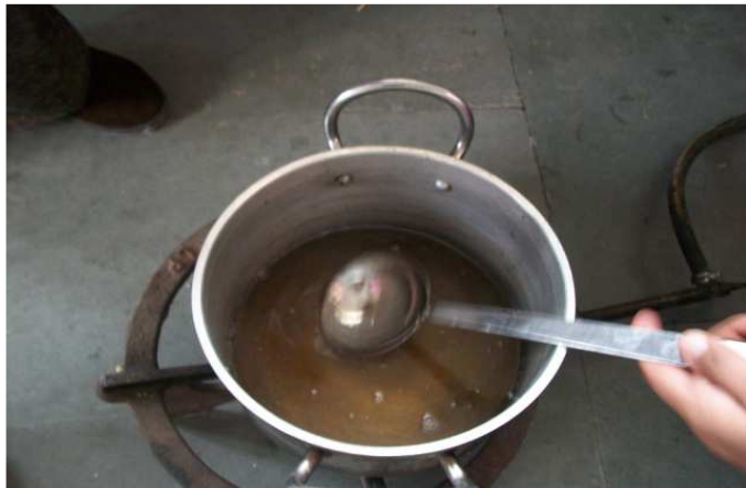
Figure 1: Shankpushpi Syrup