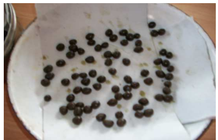
Figure 3: Shankpushpi Ghan Vati