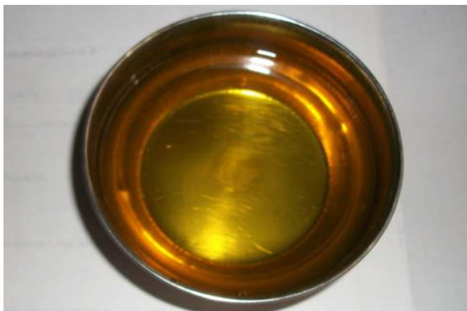
Figure 4: Shankpushpi Ghrit