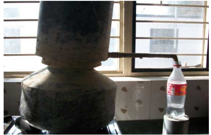
Figure 2: Shankpushpi Arka