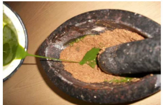
Figure 5: Shankpushpi Rasayana

Here the two samples of Shankpushpi rasayana are prepared , one with tap water and other with gangajal through same procedure.